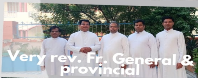
Very rev. Fr. General & provincial