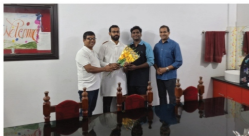
Big Brother Returns